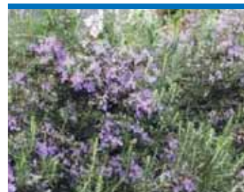
Rosmarinus officinalis (450mm)