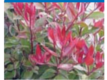
Syzigium australe 'Bush Christmas' (requires hedging)