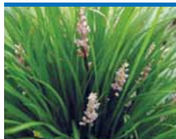
Liriope muscari 'Isabella' (350mm)