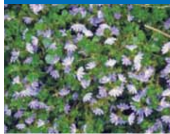
Scaevola aemula 'Mauve Clusters' (200mm)