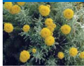
Santolina chamaecyparissus (800mm)