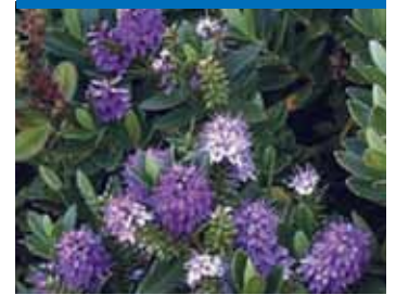
Hebe franciscana 'Blue Gem' (requires hedging)